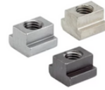
COMPLETE RANGE OF STANDARD ELEMENTS